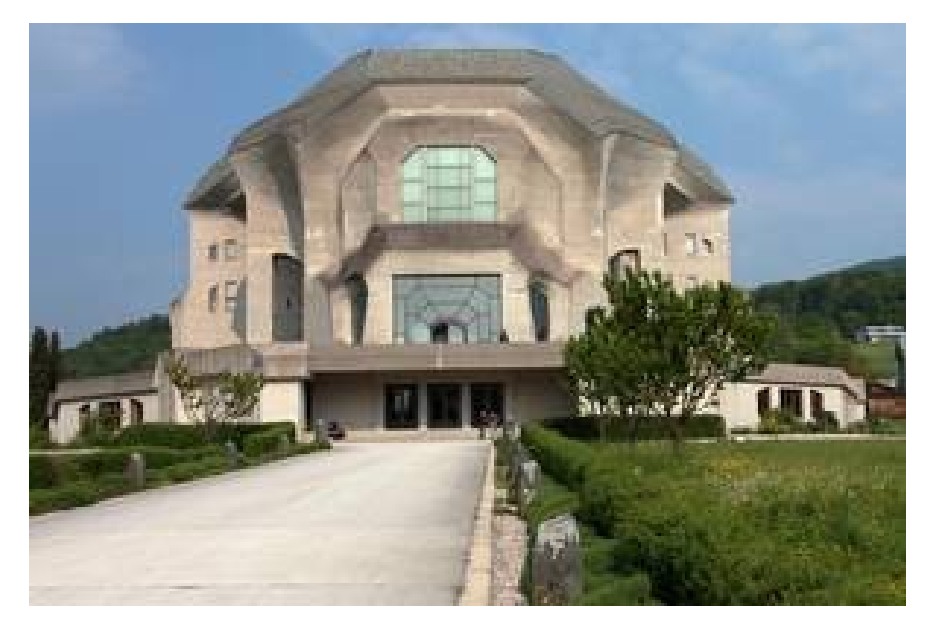
The Goetheanum in Dornach (Schwitzerland)

The new system had to handle various data types such as long text fields, selection lists or date fields. A full indexing of database content and documents with keyword search also had to be available.